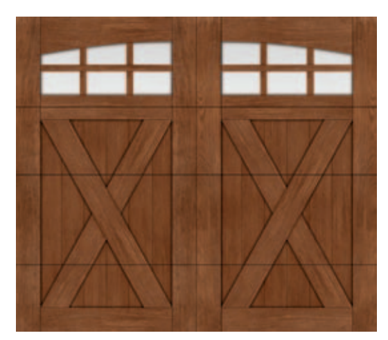
Canyon Ridge® Collection Limited Edition Series Design 21 Shown in Dark Finish with Clear Cypress Cladding, Clear Cypress Overlays and ARCH3 Window Design (Model CAN221CCARCH3).