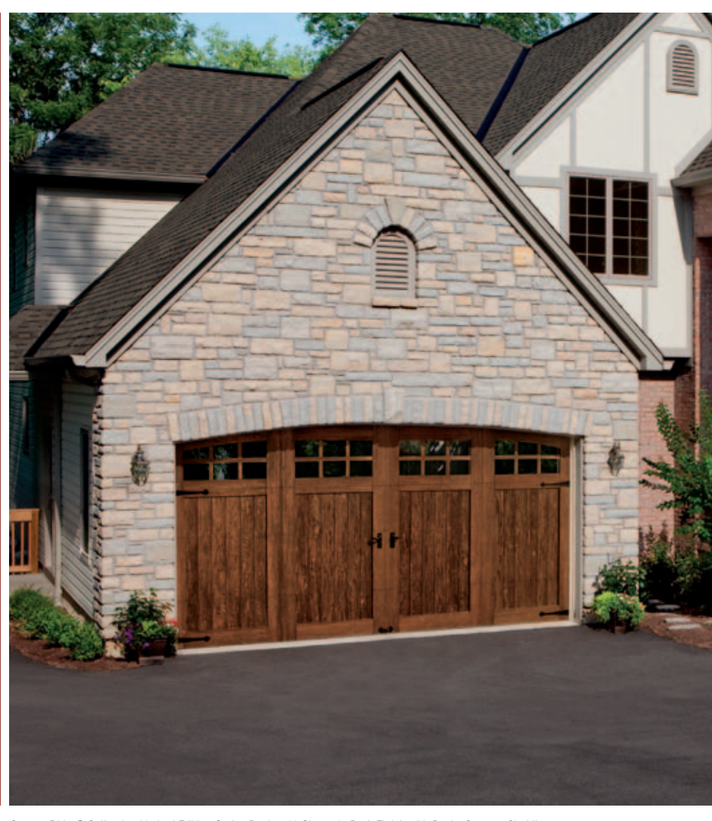
Canyon Ridge® Collection Limited Edition Series Design 11 Shown in Dark Finish with Pecky Cypress Cladding, Clear Cypress Overlays and ARC3A Window Design (Model CAN211PCARC3A).

Clopay's extensive selection of faux overlays, designs, windows, decorative hardware and finish colors can complement any home style and budget.