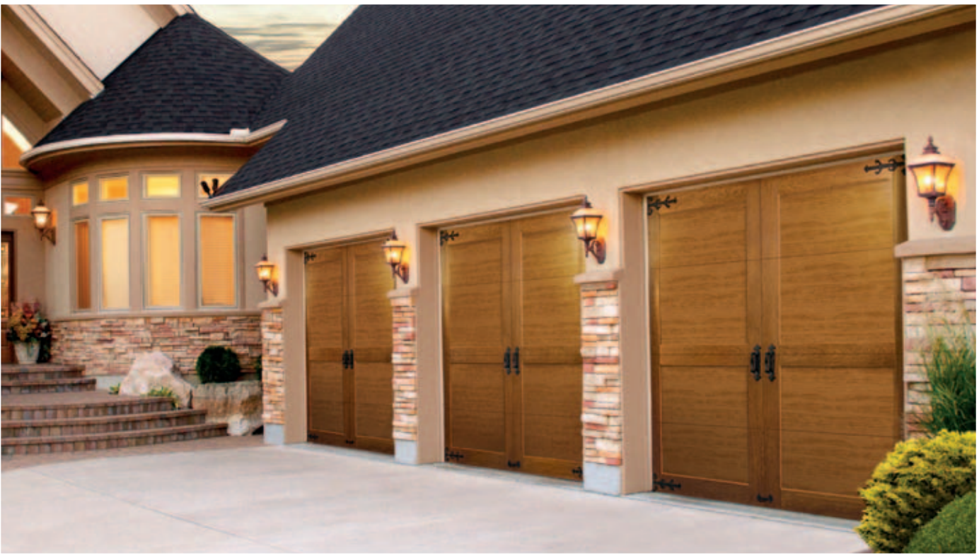
Canyon Ridge® Collection Ultra-Grain® Series Design 36 Shown in Medium Finish with Clear Cypress Overlays and TOP11 (Solid) Top Section (Model CAN236NCTOP11).