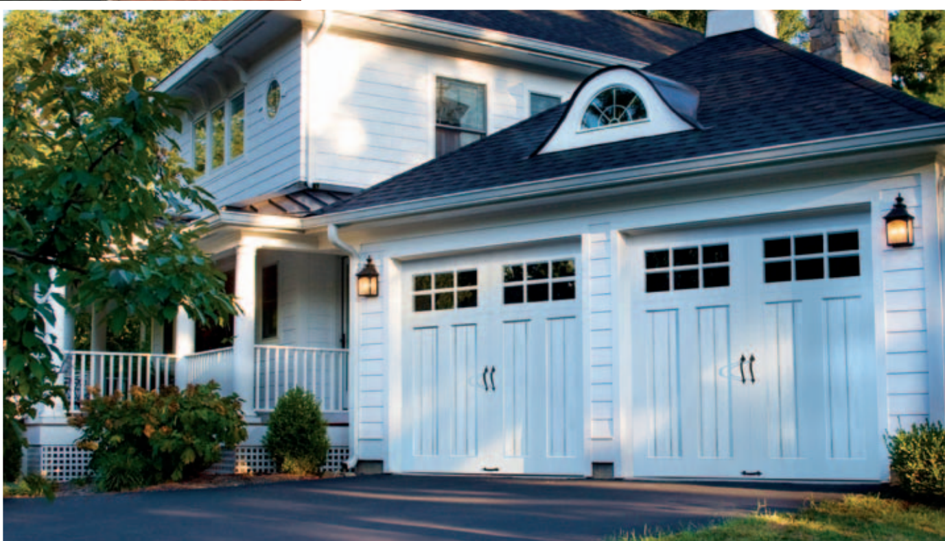
Canyon Ridge® Collection Limited Edition Series Design 12 Shown in Whitewash Finish with Mahogany Cladding, Mahogany Overlays and SQ23 Window Design (Model CAN212MMSQ23).

Note: Cladding and Overlay material options may be mixed and matched.