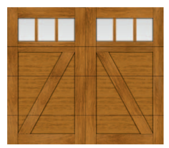
Canyon Ridge® Collection Ultra-Grain® Series Design 22 Shown in Medium Finish with Clear Cypress Overlays and REC13 Window Design (Model CAN222NCREC13).

An attractive and more economical alternative to the Limited Edition Series, this door features a 2" polyurethane steel base door with Ultra-Grain®, a durable, natural-looking, woodgrain paint finish. Stained Clear Cypress composite overlays are applied to the steel door surface to create beautiful carriage house designs.