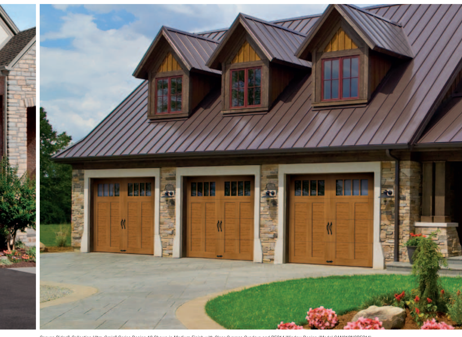
Canyon Ridge® Collection Ultra-Grain® Series Design 12 Shown in Medium Finish with Clear Cypress Overlays and REC14 Window Design (Model CAN212NCREC14).